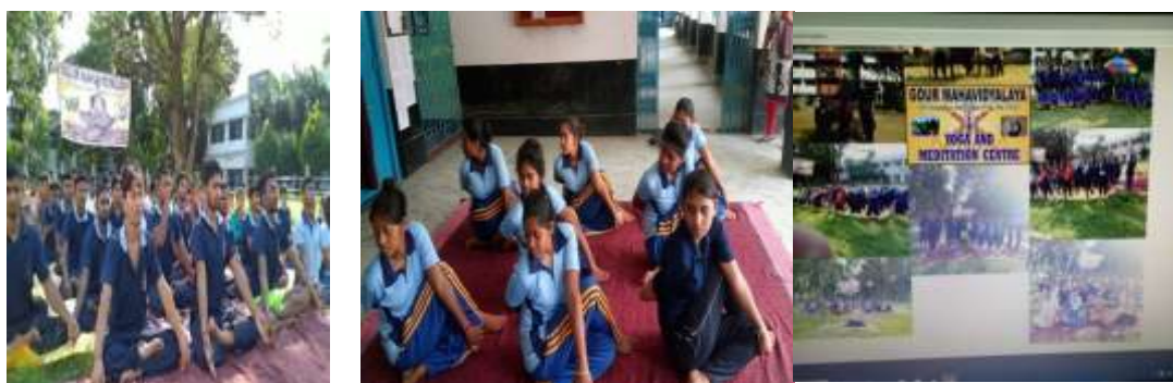
YOGA PRACTICAL CLASS:30.08.2019

P.O.- Mangalbari, Dist.: Malda. Pin-732142 Phone : 03512- 260547; Fax 03512-260547 E-mail: gour_maha@yahoo.co.in www.gourmaha.org