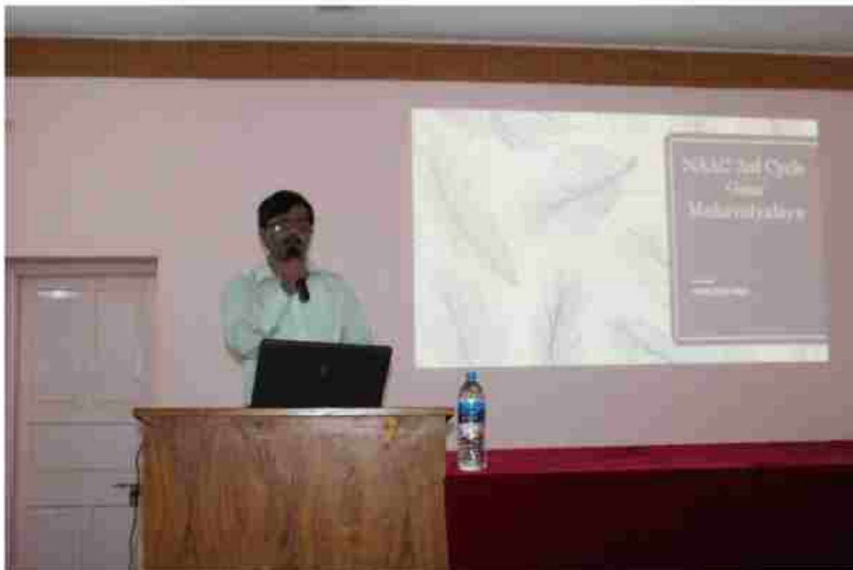
Workshop: NAAC- Vision-2021.26.4.2017.

green lawns, field ,all buildings present a picturesque look which not only provide aroma but also ease long working hours with work stress. Green campus initiative helps to create environmental awareness. Students and teachers have shown responsible attitudes and commitment to the environmental enrichment.