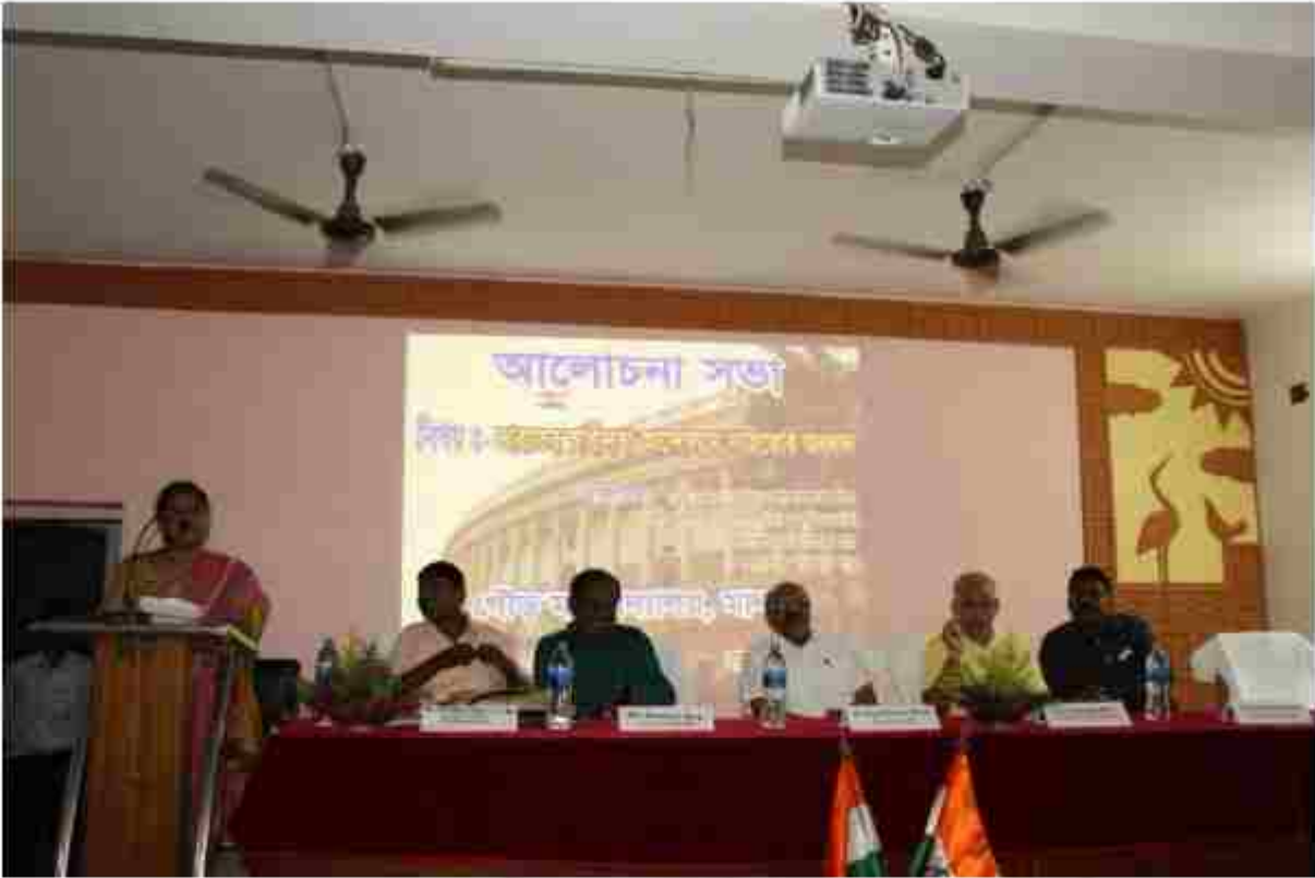
Celebration of the 15 th August: Seminar 2016.