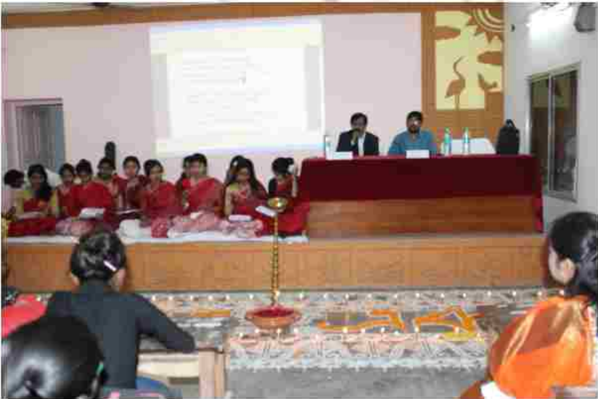
Antarjatic Matribhasa Diwas-21.3.2017.