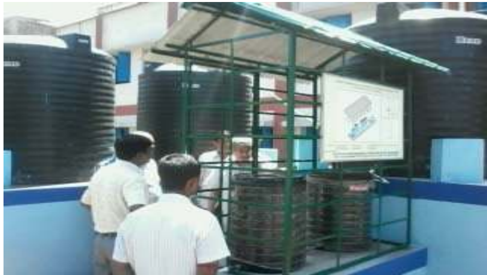
Rain Water Harvesting Plant, Gour Mahavidyalaya Malda .

There is a pressing need to accelerate the development of advanced clean energy technologies in order to address the global challenges of energy security, climate change and sustainable development. In today's scenario solar power is one of the best solution to overcome the energy deficit in the World. The generation of solar power does not have any adverse effect on the environment. The plant provides substantial cost savings on the power consumption for the college. One of the biggest challenges of the 21 st century is to overcome the growing water shortage. Rainwater harvesting has thus regained its importance as a valuable alternative or supplementary water resource. Green campus initiative helps to create environmental awareness. Students and teachers have shown responsible attitudes and commitment to the environmental enrichment.