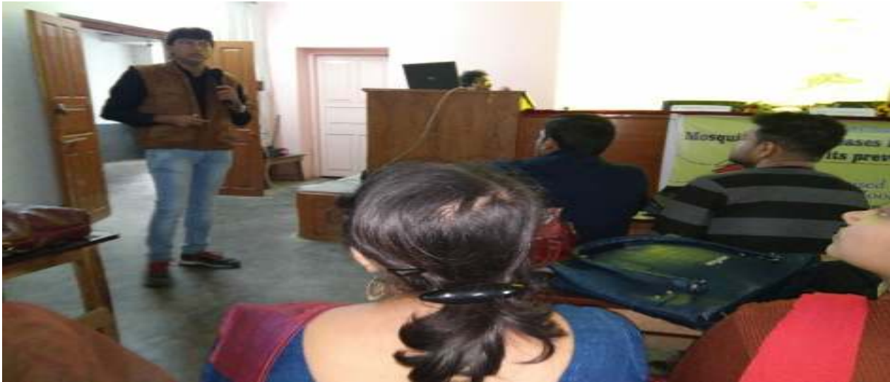
“Mosquito borne diseases in and around Malda and its prevention”- Department of Zoology, Gour Mahavidyalaya - 8 .12.2017.