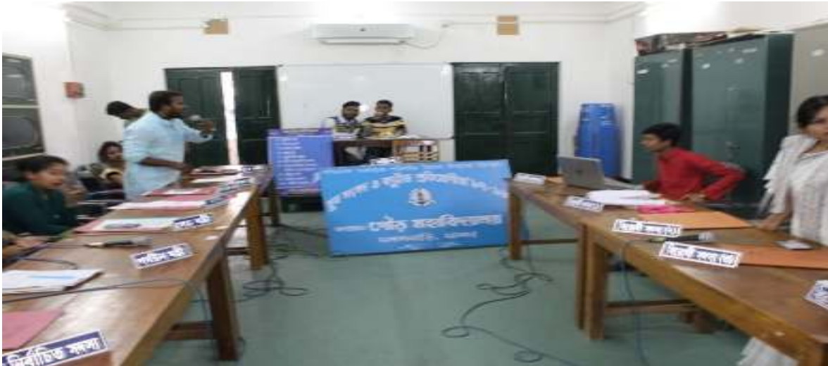
Youth Parliament: Dept:Political Science