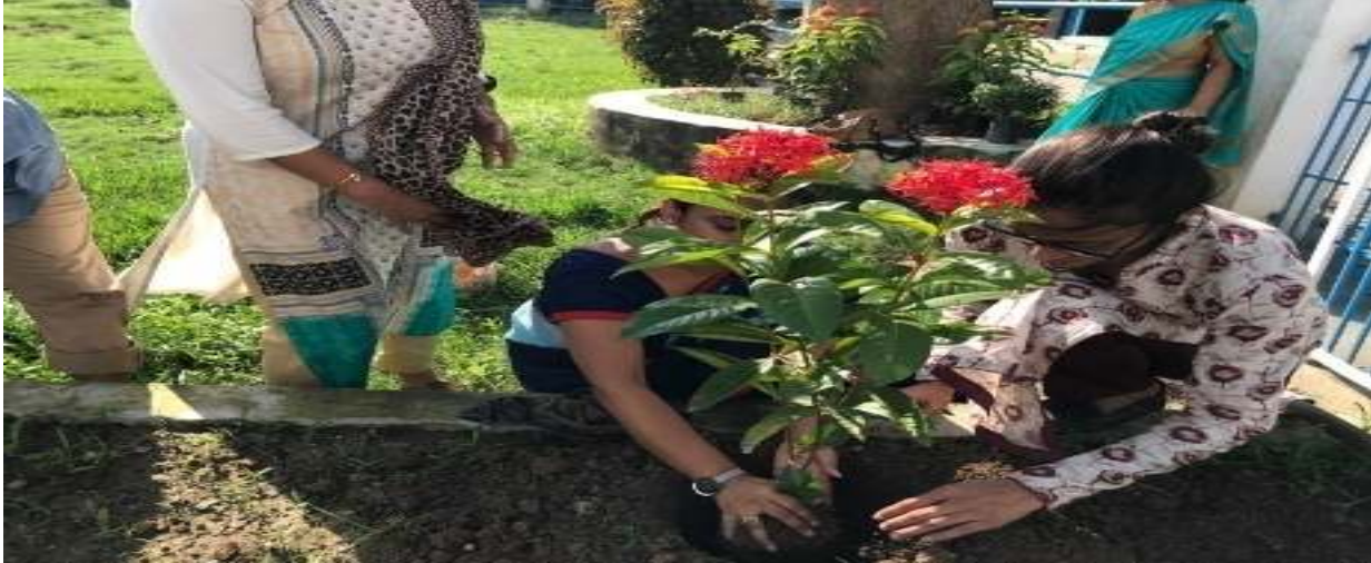
BEAUTIFICATION COMMITTEE: ARANYA SAPTAHA: PLANTATION OF SAPLINGS

BEAUTIFICATION COMMITTEE, GOUR MAHAVIDYALAYA: SWACCH BHARAT ABHIJAN: COLLEGE CAMPUS: DATE: 21.7.2018