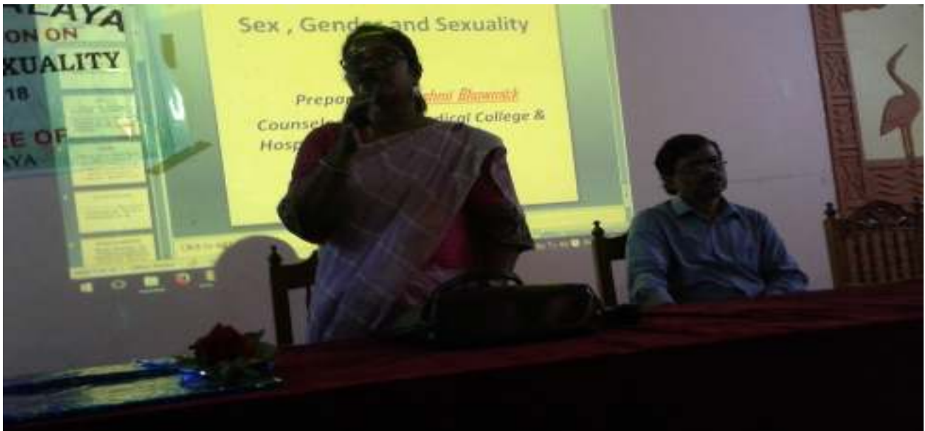
BISHAKHA COMMITTEE, GOUR MAHAVIDYALAYA, MANGALBARI, MALDA: LECTURE ON SEX, GENDER AND SEXUALITY, SEMINAR HALL.GOUR MAHAVIDYALAYA, MANGALBARI, MALDA.5.10.2018.