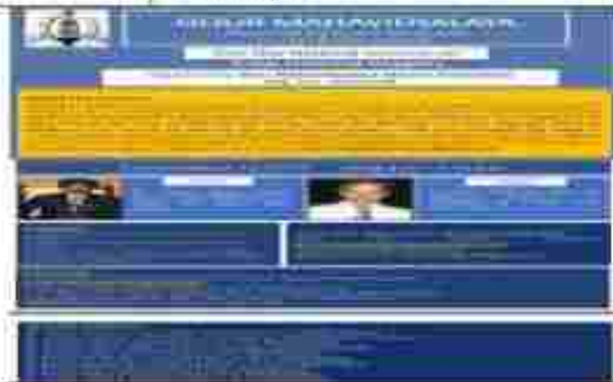
Seminar with Malda Womens college , Malda