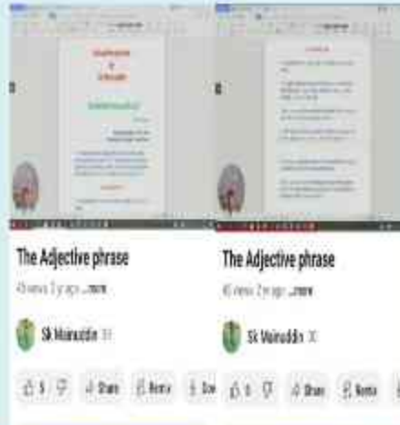
STUDY MATERIALS PROVIDED IN ONLINE: PLATFORM: YOUTUBE: 09.08.2020: LINK: https://youtu.be/zWxo_1dUIbk