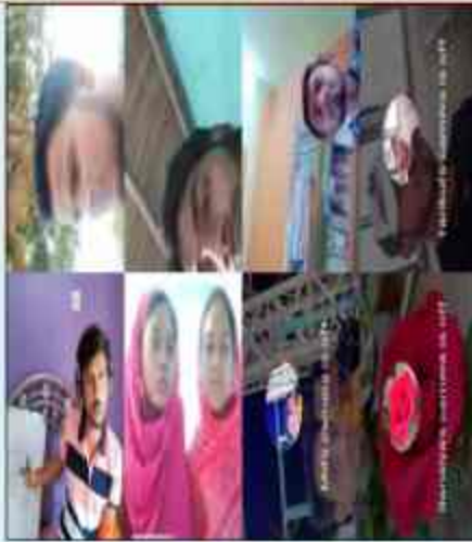
ONLINE CLASS: SEM - III: 01.10.2020