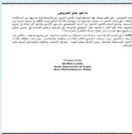
STUDY MATERIALS PROVIDED IN ONLINE, PLAT FORM: GOOGLE DRIVE: 28.04.2021 LINK: https://drive.google.com/drive/folders/1dXfaRAkfLMDyw-i164aGq3gl2mVnNf