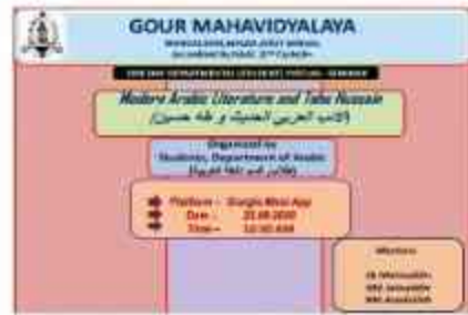
DEPARTMENTAL WEBINAR ON THE TOPIC "MODERN ARABIC LITERATURE AND DR. TAHA HOSSAIN": ONLINE: 22.09.2020