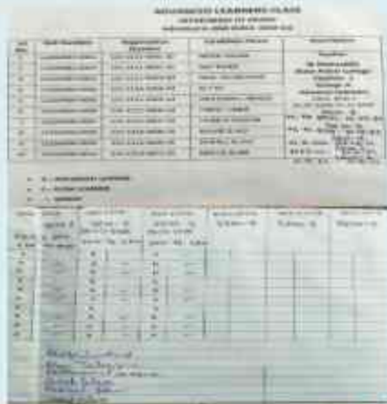
ADVANCE LEARNERS CLASS: SEM- 1 OFFLINE: DATE - 03.02.2021