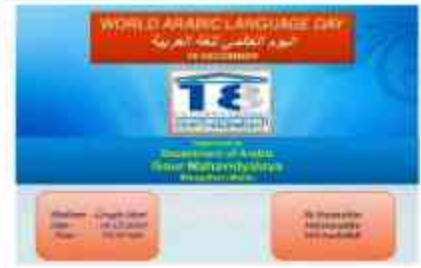
ORGANIZED "WORLD ARABIC LANGUAGE DAY": ONLINE: 18.12.2020