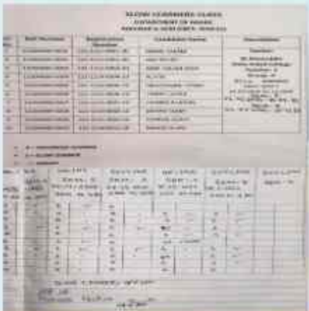
SLOW LEARNERS CLASS: SEM-1 OFFLINE: DATE: 04.02.21