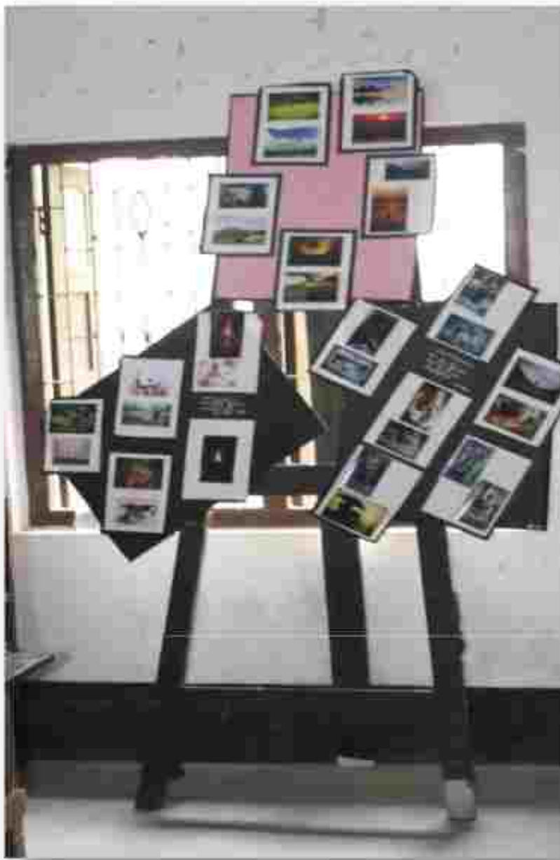
ILLUSTRATION OF DIVERSITY