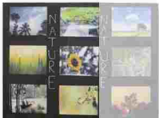
ILLUSTRATION OF NATURE