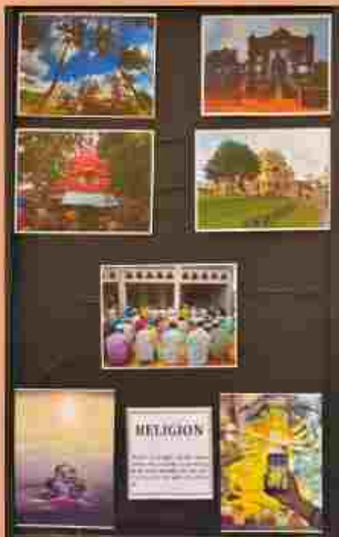
RELIGION MAKES HUMANITY