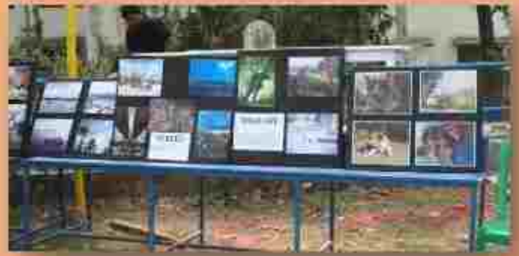
IMPORTANCE OF NATURE

A WONDERFUL TELUGU SONG 'SRIVALLI' PERFORMED BY 2 ND SEMESTER STUDENT SHAISHAB MONDAL