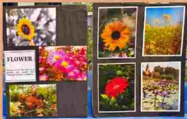
COLOURFUL FLOWERS MAKE COLOURFUL NATURE