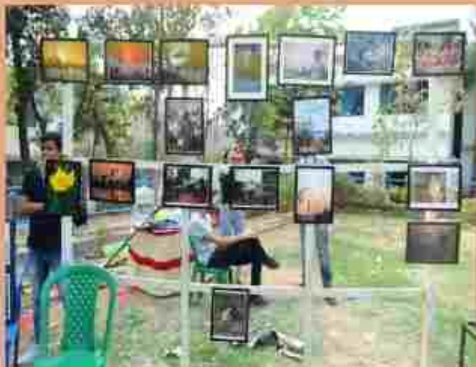
DIFFERENT ASPECTS IN ONE FRAME