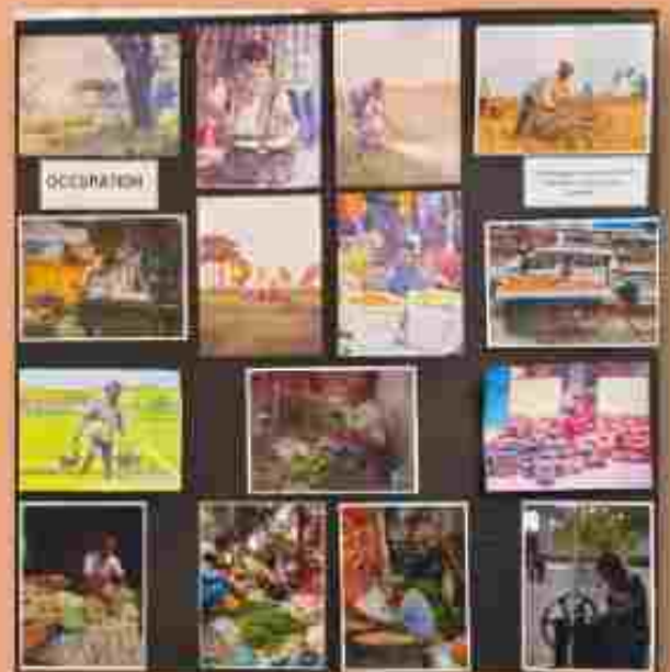
OCCUPATION FOR HUMAN LIFE