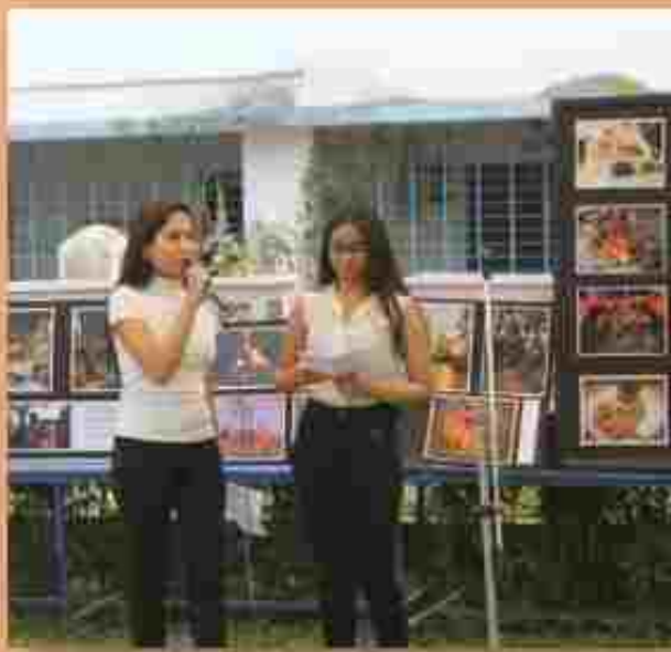
STUDENTS OF THE 6 TH SEMESTER HOSTING THE PHOTOGRAPHY EXHIBITION 2023