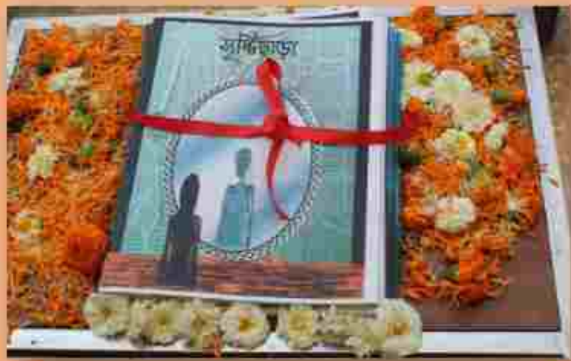
ANNUAL MAGAZINE OF THE MASS COMMUNICATION AND JOURNALISM DEPARTMENT