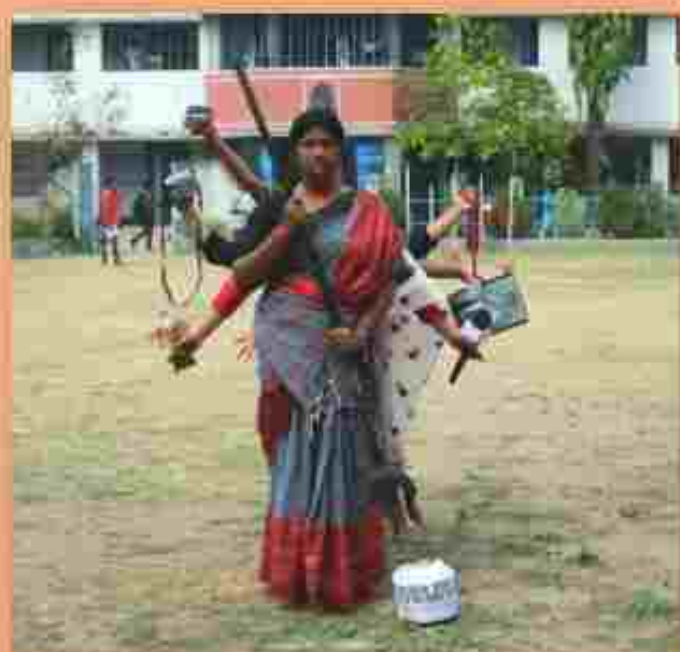
SHORT DRAMA ON WOMEN EMPOWERMENT