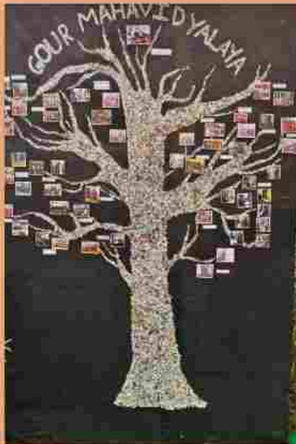
THE FAMILY TREE OF GOUR MAHAVIDYALAYA.