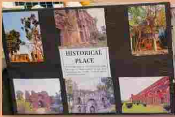
HISTORY OF GOUR BANGA