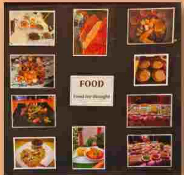
FOOD CULTURE OF GOUR BANGA