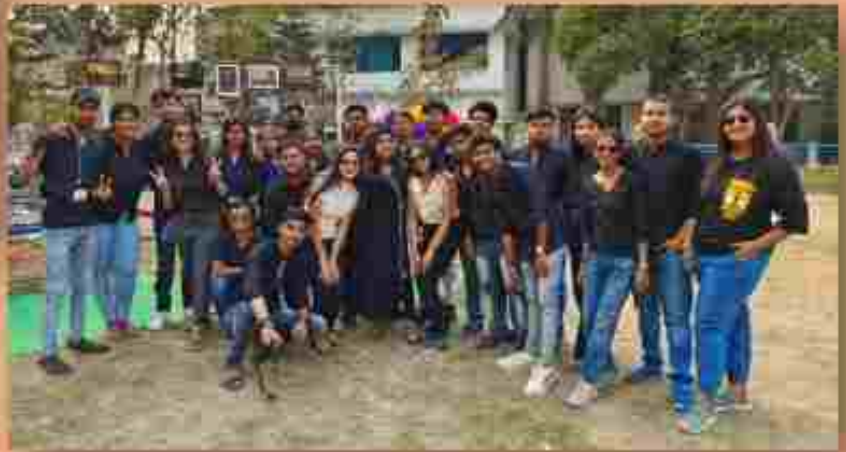
ALL STUDENTS AND TEACHER OF MASS COMMUNICATION AND JOURNALISM DEPARTMENT