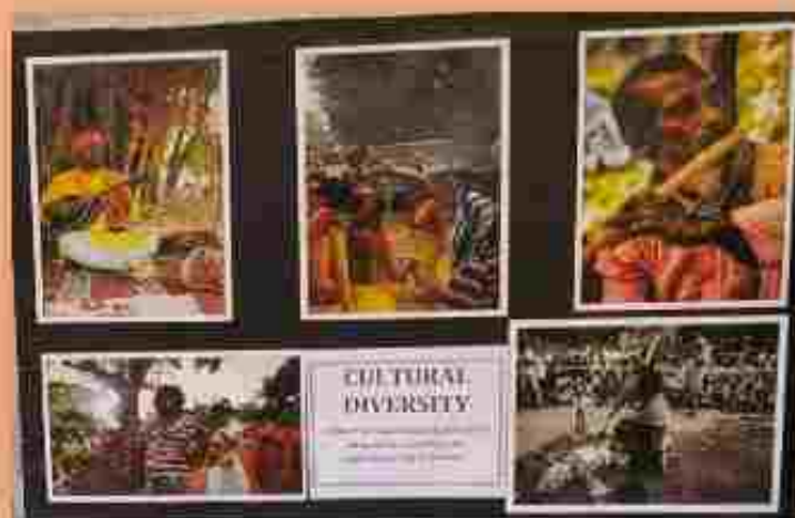
CULTURAL DIVERSITY IN OUR SOCIETY