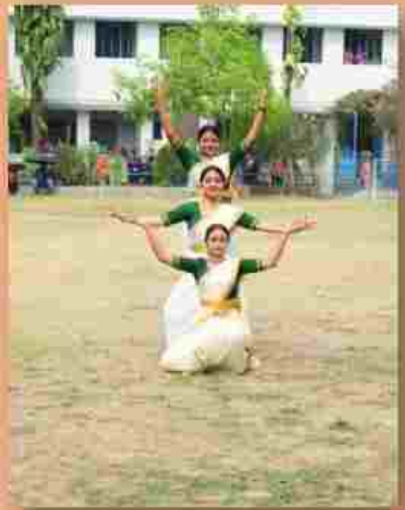
INAUGURATION PERFORMANCE OF PHOTOGRAPHY EXHIBITION 2023