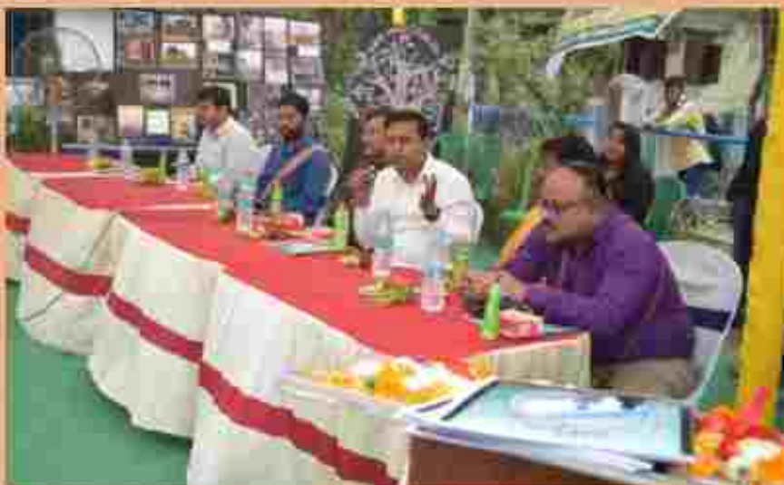
SPECIAL THANKS TO OUR HONOURABLE PRINCIPAL SIR AND OUR RESPECTED GUEST FOR MAKING OUR PHOTOGRAPHY EXHIBITION SUCCESSFUL.