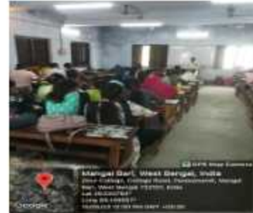
ADVANCED LEARNERS CLASS