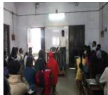
ADVANCED LEARNERS CLASS:1.2.2023: ASSIGNMENT