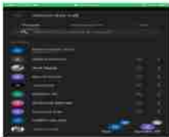
MASS COMMUNICATION: 10.03.2023