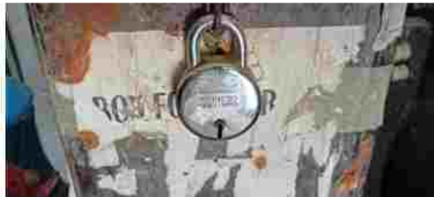
GOUR MAHAVIDYALAYA, MALDA, GRIEVANCE/COMPLAIN LETTER-BOX