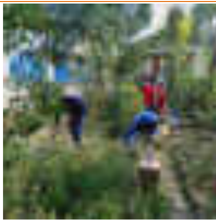
( GARDEN: CLEANING,MANURING)

Garden: Many Gardens have been developed :(No.1). Flower Garden (No.1):372”922”.(2). Flower Garden (No.2):511”-517”.(3). Flower Garden (No.3):508”-119”.(4). Flower Garden (No.4):385”-415”.(5). Flower Garden ( No.5).:237”-294”.(6). Garden of Medicinal plants:669”- 116”.(7). Garden of Medicinal plants (No.2):610”-1189”, (8). Garden in front of Library)(9). EX-situ conservation garden (NO.1).(10). Herbarium (NO.1) and (11). Arboretum .The Beautification Committee looks after the matter of gardening. The college gardens are maintained by the gardener appointed by the institute( expenditure incurred in connection with gardening—Rs.34,160/).