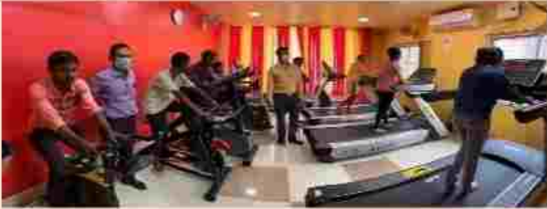
PHYSICAL EDUCATION:CBCS: SEMESTER1 and111-TOUR:15.03.2021,MALDA