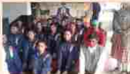
PRACTICAL : YOGA PRACTICE:18.04.2021)

1.EXPERIMENTAL LEARNING: One example of experiential learning is going to the zoo or factory or Yoga centre and learning through observation and interaction with the environment, as opposed to reading about animals, production system in a factory or practice of Yoga from a book. Thus, one makes discoveries and experiments with knowledge firsthand, instead of hearing or reading about others' experiences.