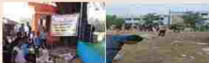
EXTENSION ACTIVITIES: AT VILLAGE BHATRA AND SWACCH BHARAT ABHIYAN:26.01.2021)

(h) Participation in extension activities: The National Service Scheme is a students' empowerment programme through campus community interaction. Two units are vibrant and active. The N.S.S. volunteers have been working for the upliftment of the village community.They have identified the needs and problems of the villagers of Bhatra,Sahapur, Old Malda Block . They have developed a sense of social and civic responsibilities. They have gained skills in mobilizing community participation.They have placed community interest before individual interest. Programme officers have encouraged the volunteers to participate in the N.S.S activities through corporate living and cooperative action.