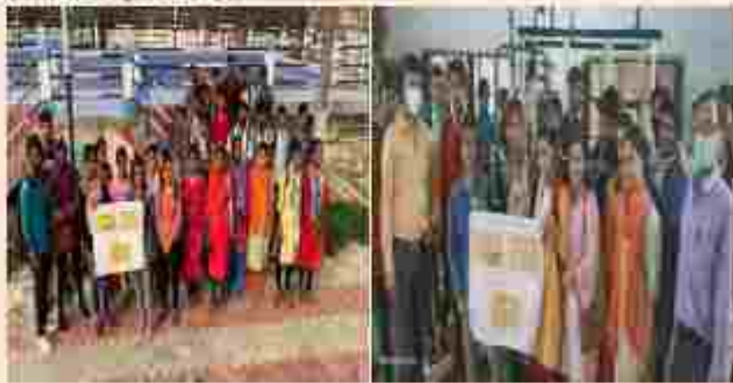
PHYSICAL EDUCATION:CBCS:SEMESTER 1 and111-TOUR:15.03.2021: YOGA CENTRE,MALDA

(d).Exhibition: Students organize exhibition,and show their creativity.