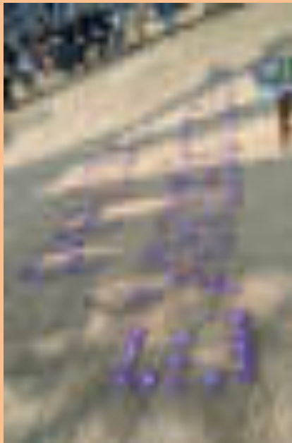
Decoration photo exhibition