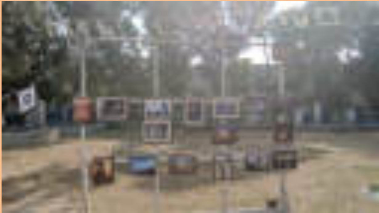
Students snapshots exhibited