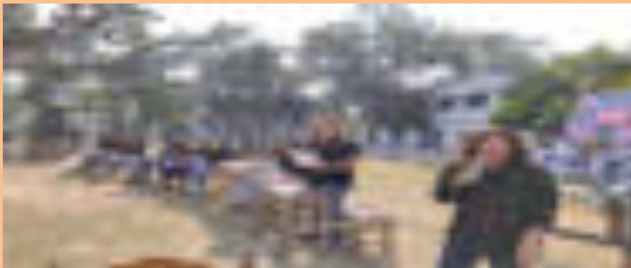
Student doing anchoring and performing