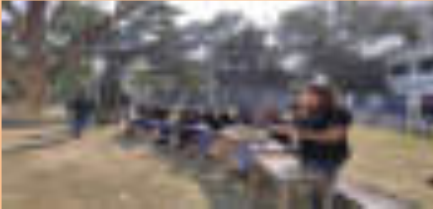
Students performing a drama named Arja Onarja by Rabindranath Tagore.

As already mentioned mass communication also includes folk culture which helps the students to enhance their skill in theatre also. As it is the basic of a communication process. The person involves in folk culture become the artist, here the students of the department are the one in every respect.