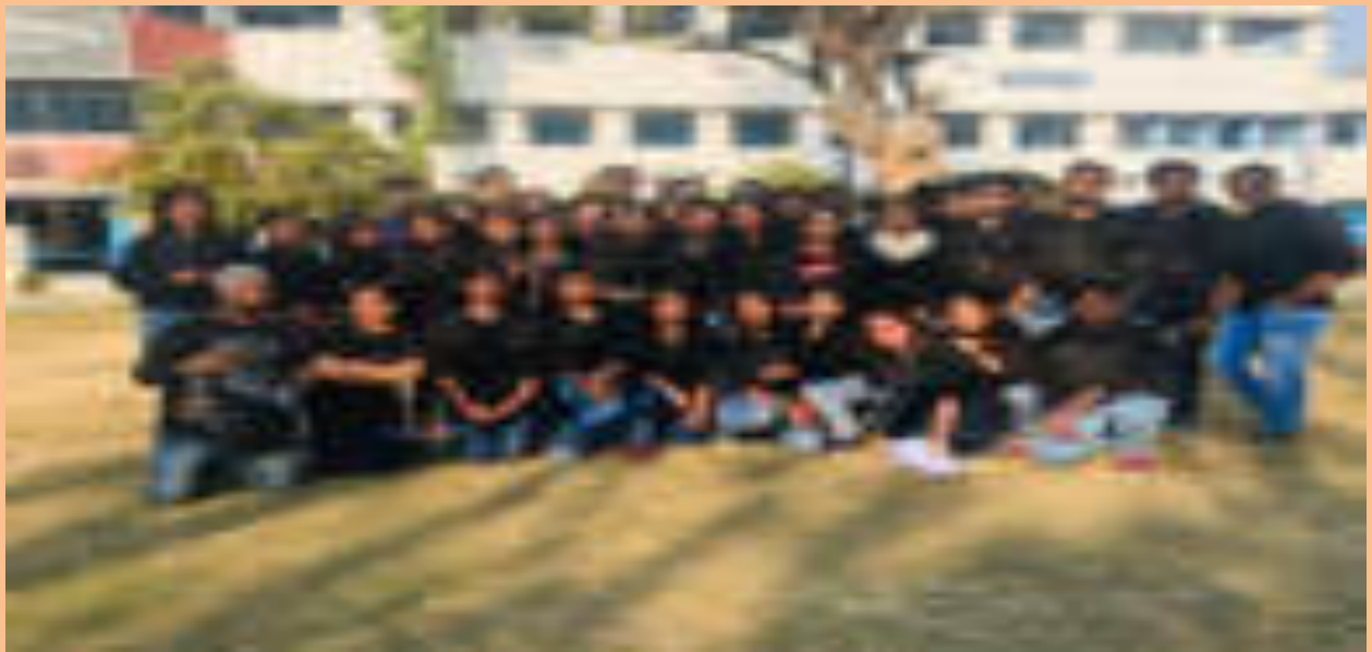
Teacher and students group photo