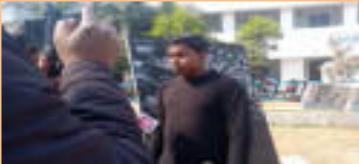
Aspiring a students who wants to persue a career in media is enhancing their skill by facing the camera