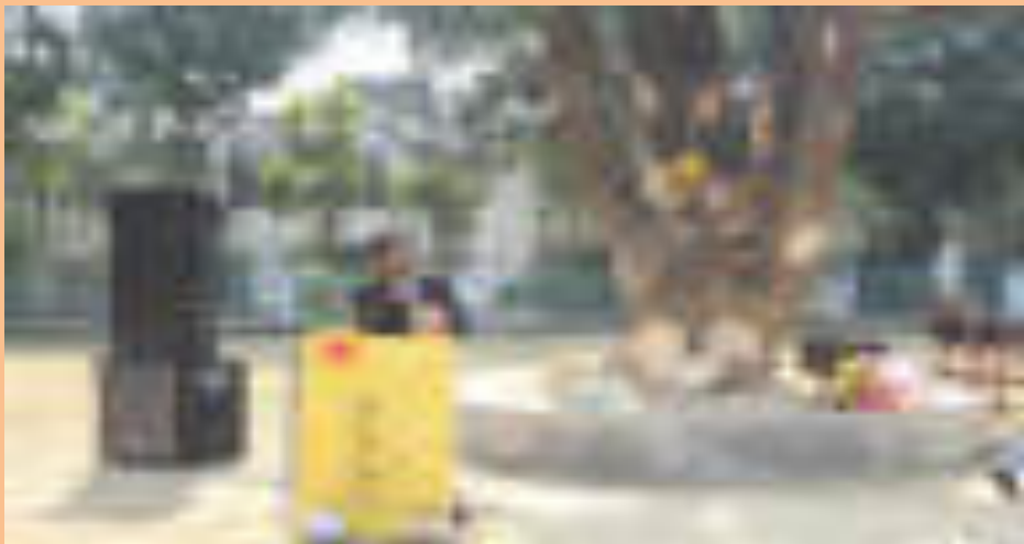
Principal Sir delivering the speech