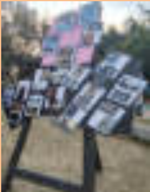
Students snapshots exhibited