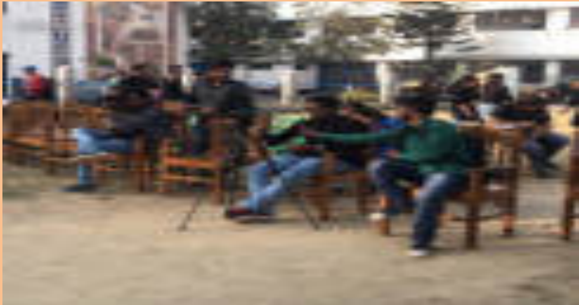
Photography skill practiced by the students