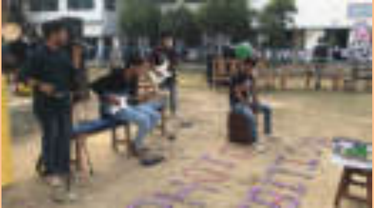
The students of the department performing