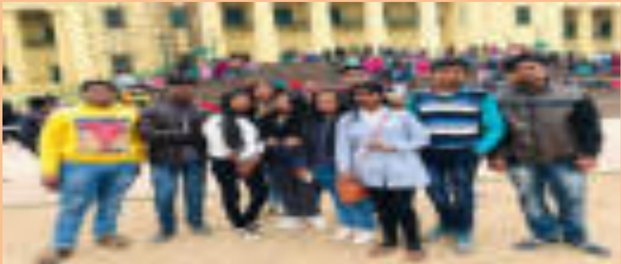
Teacher and students group photo