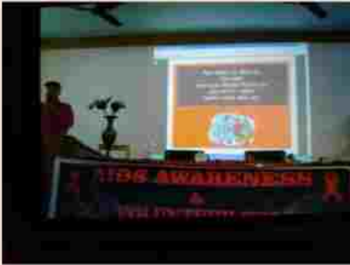
(2018-19- 1.12.2018; WORLD AIDS DAY : SPECIAL LECTURE)