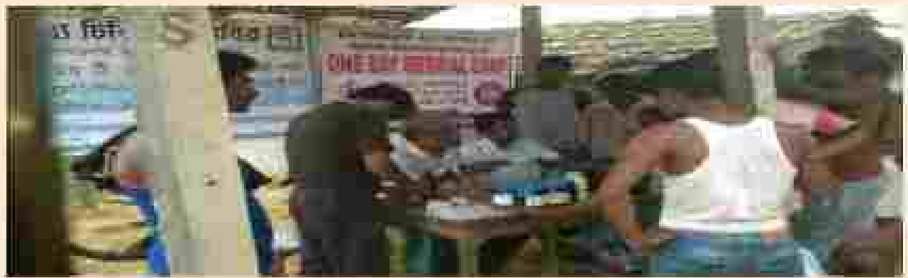
(Village: Bhatra, Sahapur, Old Malda:One Day Free Medical Camp: Medical Camp:15.5.2019; Venue: Village Bhatra, Sahapur, Old Malda)