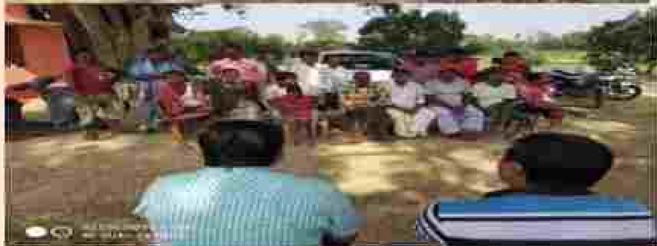
Village :Bhatra:Workshop on Community farming: Date:26.11.2019.