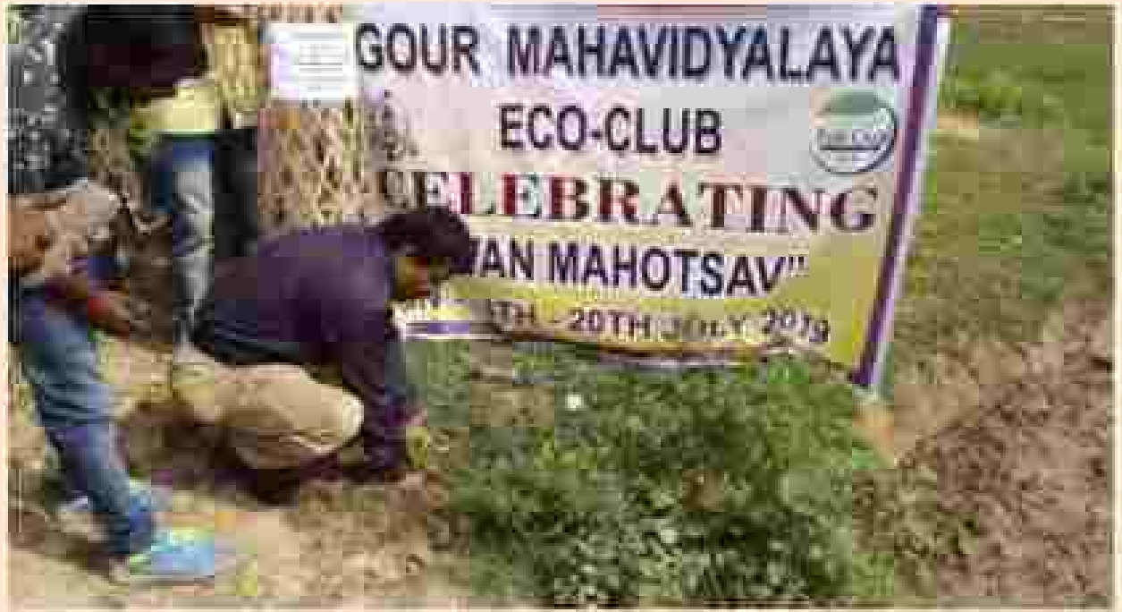
( SAPLINGS DISTRIBUTION AND PLANTATION : ADOPTED VILLAGE BHATHA)