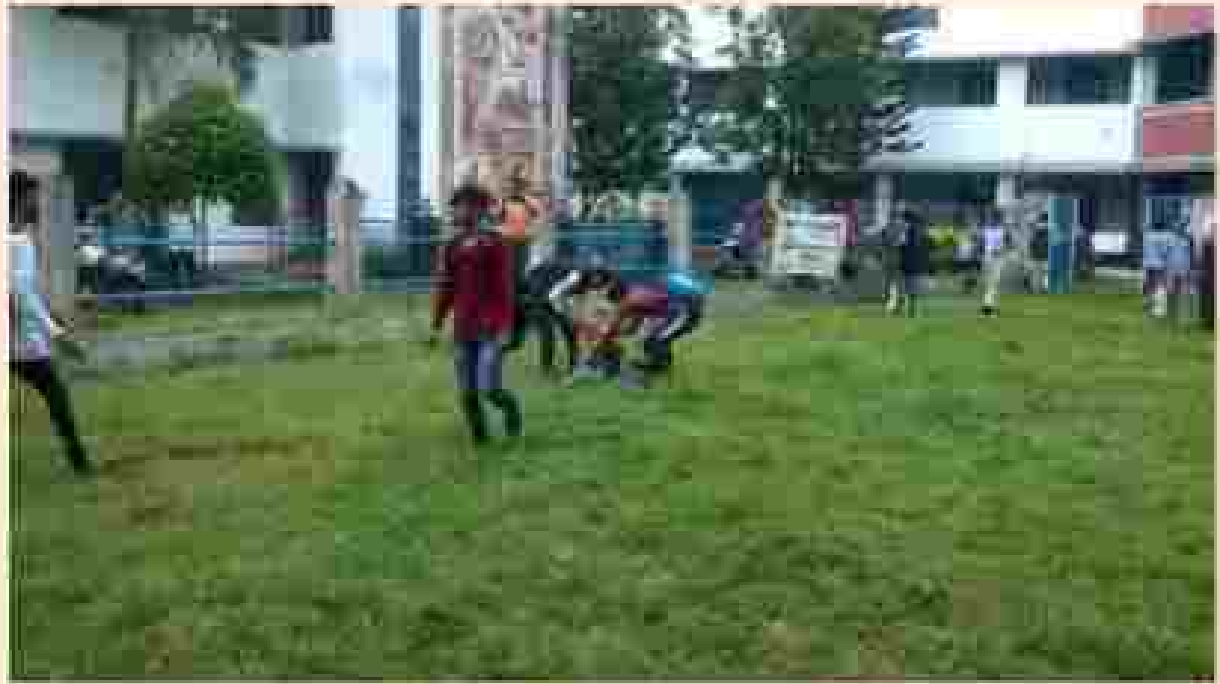
( Swacch Bharat Abhiyan: 6.8.2019)