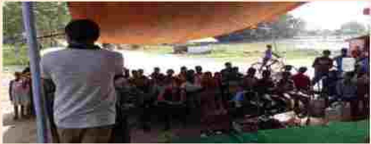
Syfujjaman Tarafder, Convenor, Eco-club, delivered a lecture.