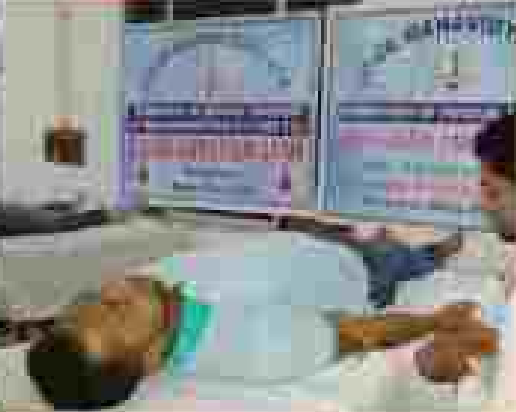
( BLOOD DONATION CAMP: ORGANIZED BY THE DEPARTMENT OF PHYSICAL EDUCATION AND N.S.S.UNITS: 16.03.2020-17.03.2020)