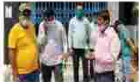
Handwritten caption in Bengali below the image

Main body of handwritten Bengali text in the Facebook post, detailing the distribution of hand sanitizer.