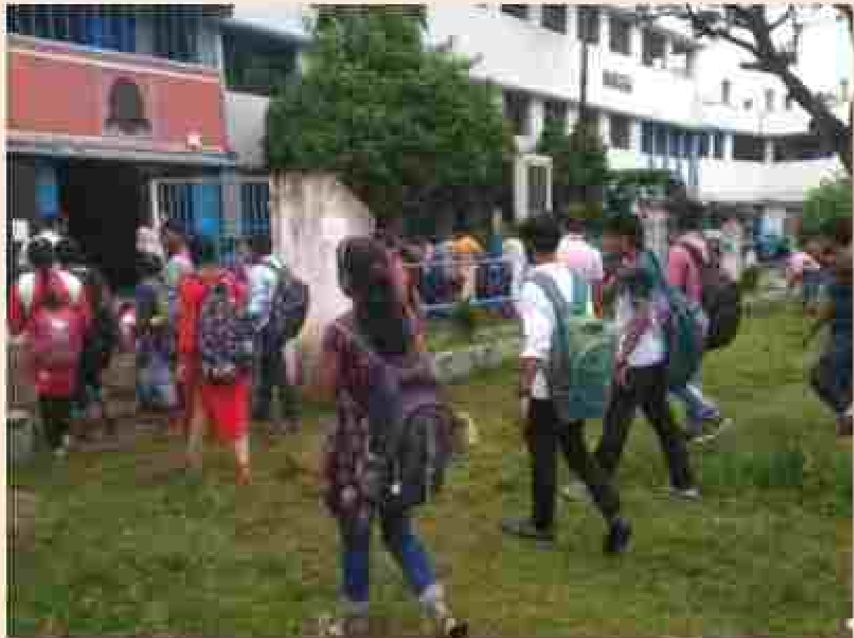
( SWACCH BHARAT ABIYAN: 23.07.2019)