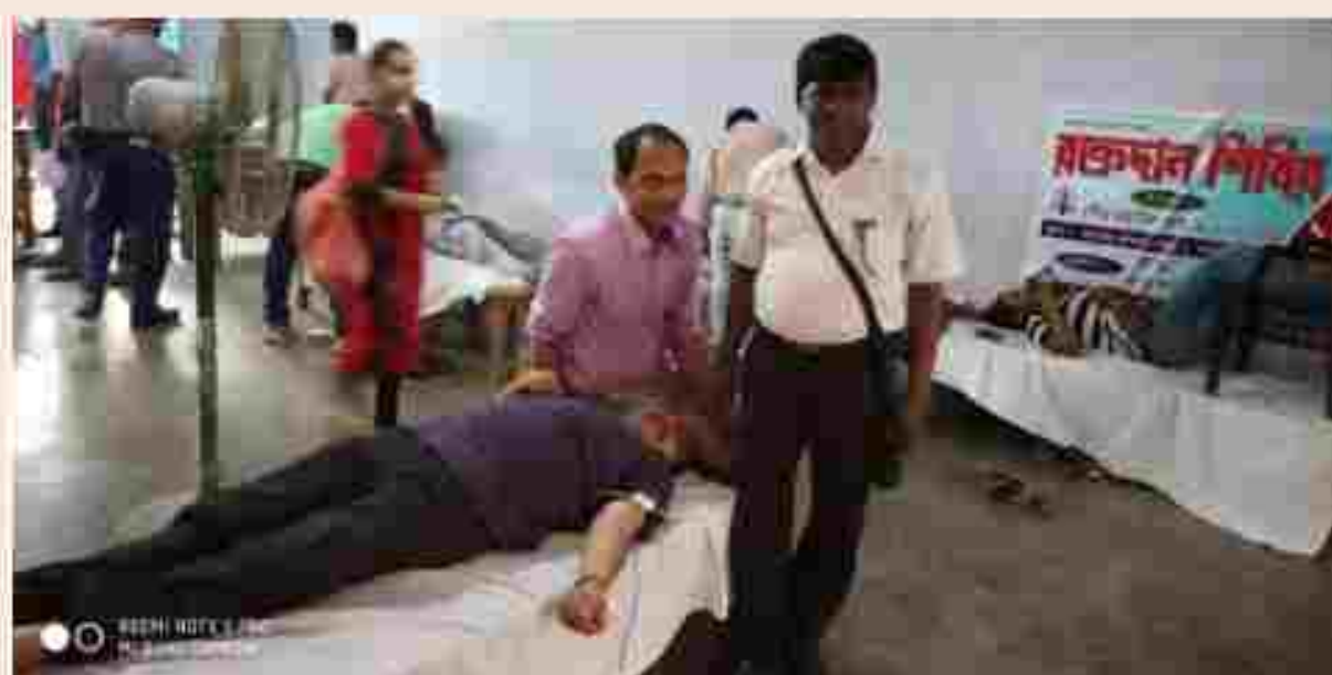
N.S.S. UNIT-1 and 11: BLOOD DONATION CAMP,15.4.2019