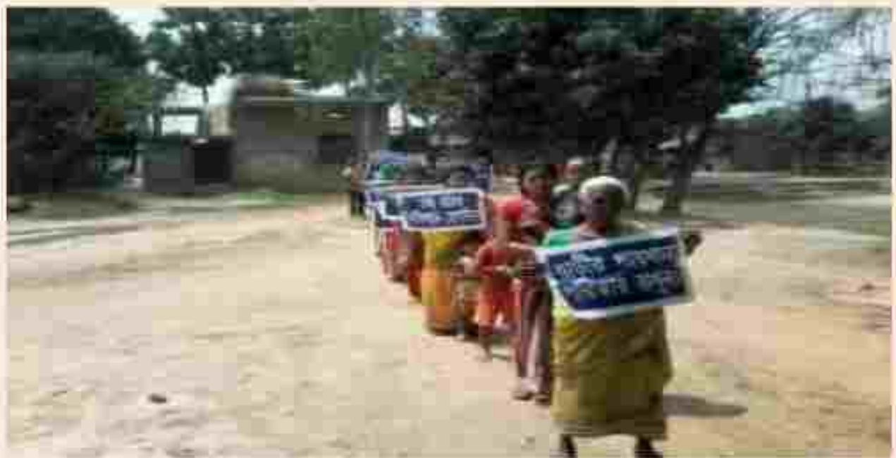
( VILLAGE : KAMANCHA )