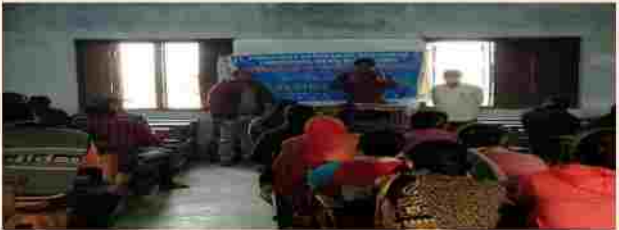
( DEPARTMENT: HISTORY:WORLD AIDS DAY: 01.12.2020-ORGANIZED BY N.S.S. UNIT -1 AND OLD MALDA SAHAYOGITA SAMITI)