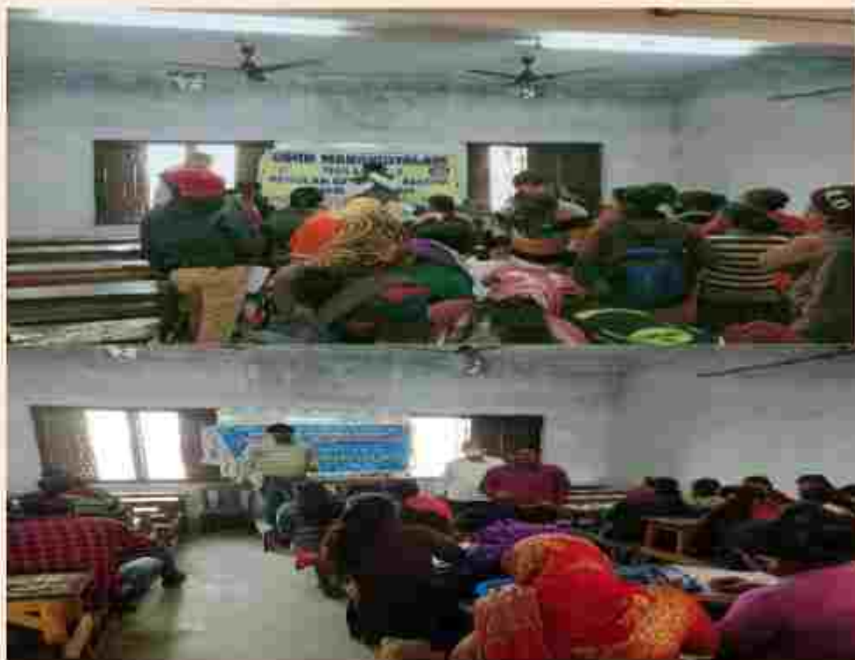
( DEPARTMENT: HISTORY:12.04.2021: SPECIAL LECTURE ON DENGUE: ORGANIZED BY N.S.S.UNIT-1)