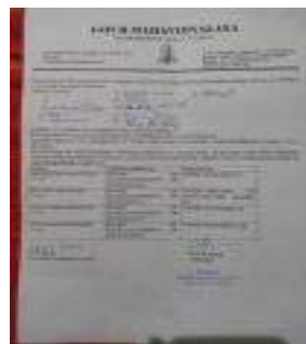
( RESOLUTION OF THE ACADEMIC COUNCIL)