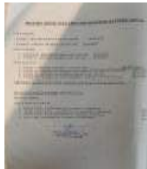
( HISTORY:SYLLABUS PREPARED BY THE BOARD OF STUDY, UNIVERSITY OF GOUR BANGA)