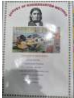
( PROJECT REPORT)