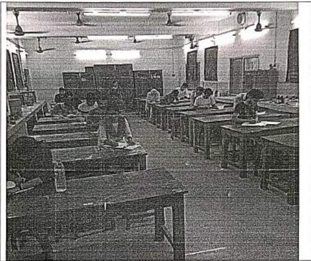
ADVANCED AND SLOW LEARNERS EXAM