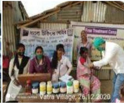
FREE MEDICAL CAMP: 26.12.20