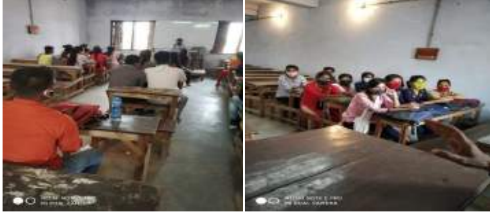
ADVANCED LEARNERS CLASS 12.12.2021-18.12.2021

STUDENT-SEMINAR: SUBMISSION OF ASSIGNMENT:2020-2021 NOTICE: HEAD OF THE DEPARTMENT: SANSKRIT