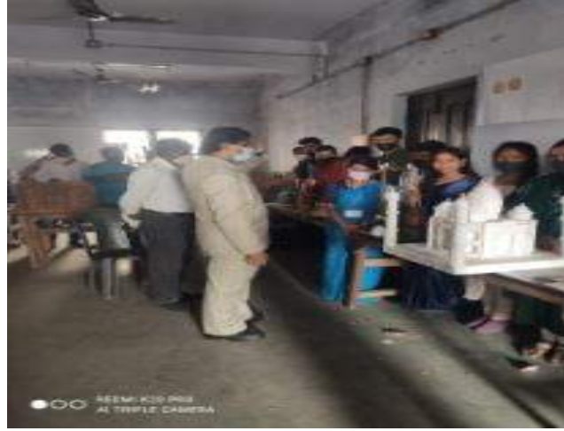
PRECEEDING YEAR EXHIBITION: DEPARTMENT: SANSKRIT: 4.2.2022