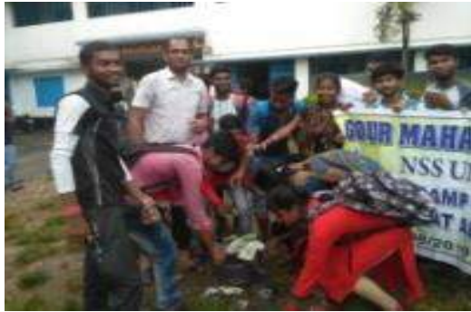
SWACHH BHARAT ABHIYAN: 5.4.2022

( Blood donation camp:02.03.2020: Venue: Gour Mahavidyalaya)