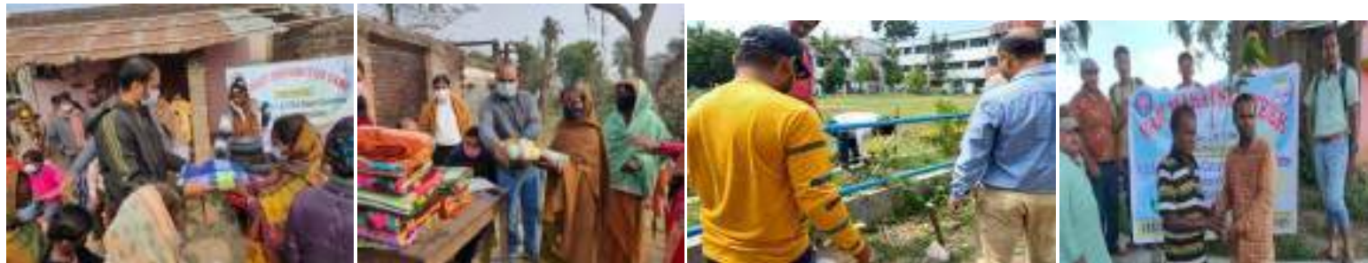
BLANKETS DISTRUBUTION: ADOPTED VILLAGE: BHATRA