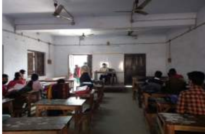
Mentor-Mentee Programme during lockdown