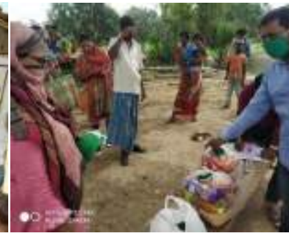
PANDEMIC RELIEF WORK 29.06.2020