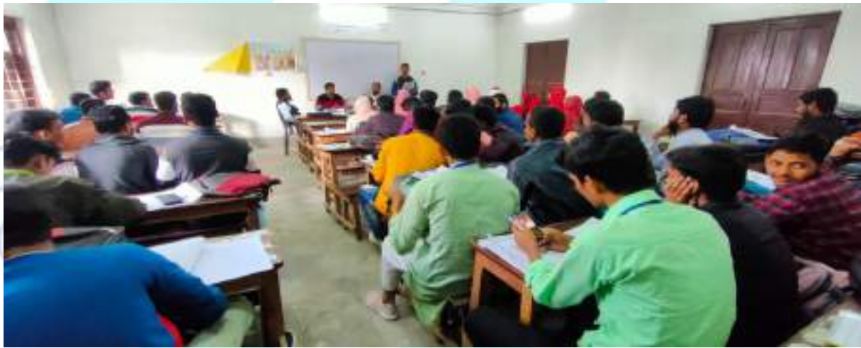
Snippets of Advance Learners