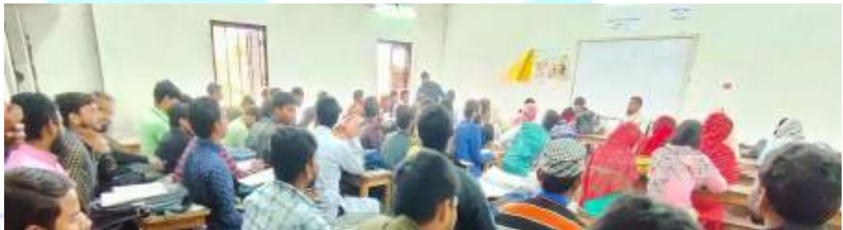
List of Slow-Advanced Learners