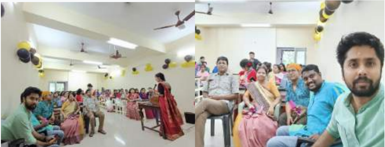
Students and teachers participated in the fresher welcome

Like every year, this year also the fresher welcome event was celebrated. The old students of the department welcomed the new ones. The day is celebrated with dance, song, speech.