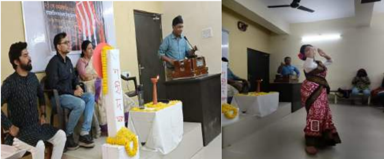
Student & teachers performing in mother language day

International mother language day celebration is a must activity of Bengali department. In this session too, Mother Language Day was celebrated in a grand ceremony.