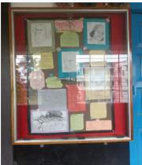
Departmental wall magazine 'bokulkoth' published by student of the department

Wall magazine 'Bakulkatha' has been published this year like every year. Students of the department have written poems, stories, travelogues, memoirs in it. As a result, students get an opportunity to express their creativity.