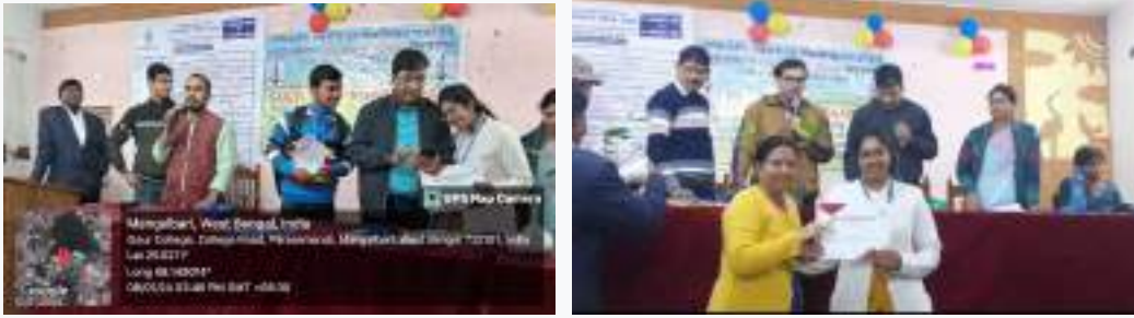
Students and teachers in Student week celebration

They participated in Essay Competition, Music Competition, Debate etc. and win prize.