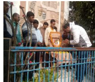
OBSERVATION OF SUBHASH CHANDRA BASU BIRTH DAY