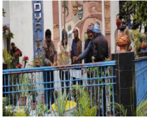
Observation of the Republic Day