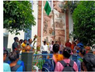
Observation of the Independence Day