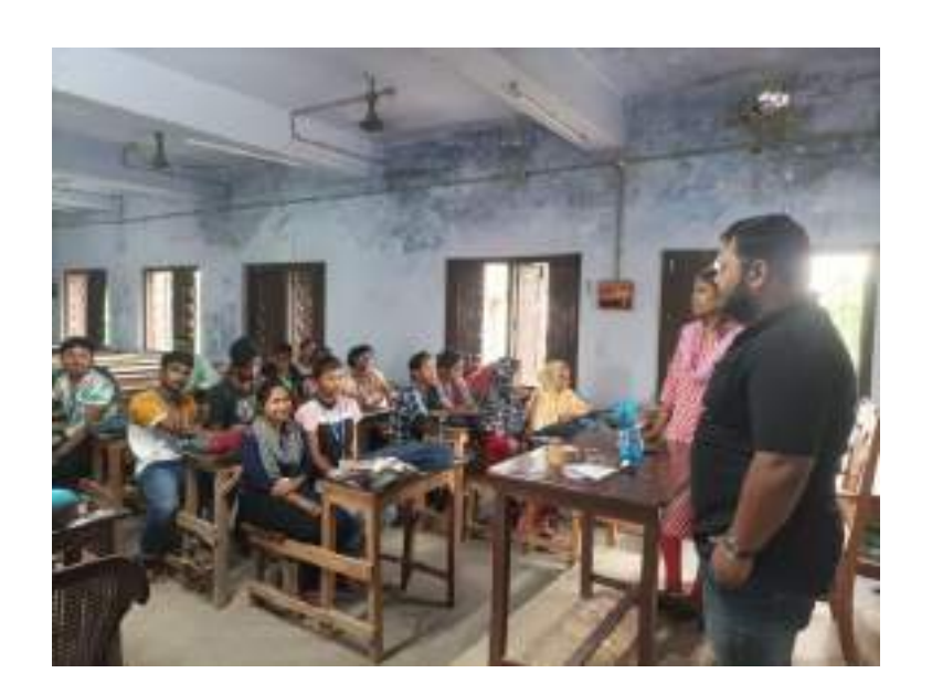
Photograph of student's seminar and class