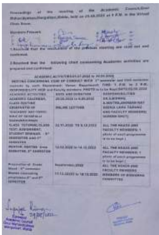
Proceeding of the meeting of the Academic Council