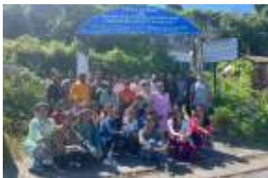
Visit to Kurseong

Such experiential mode of learning is particularly helpful as the students experience first-hand the landscape and the socio-cultural setting against which the characters of some of the texts on their syllabus move and make meaning of their life. The Educational Tour to Shillong and North-East India helped the students appreciate the poetry of Mamang Dai much better. Educational Tour to Kurseong