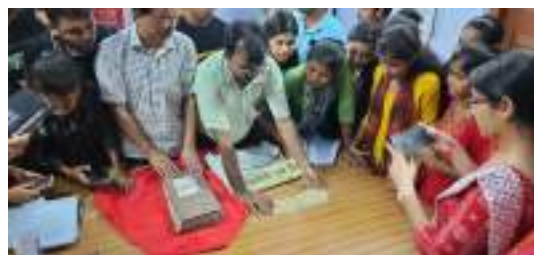
Visit to District Library Malda