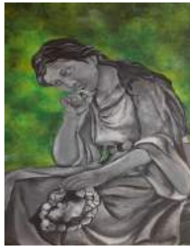
& Paintings by Students