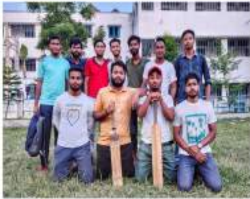
Students after participating in inter-departmental cricket match