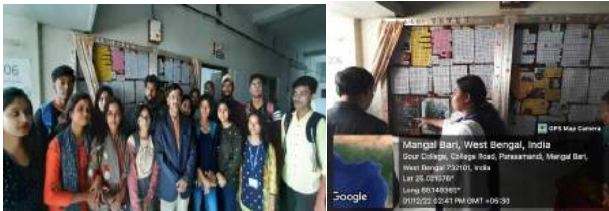
Students with the Principal de-screening the Wall magazine