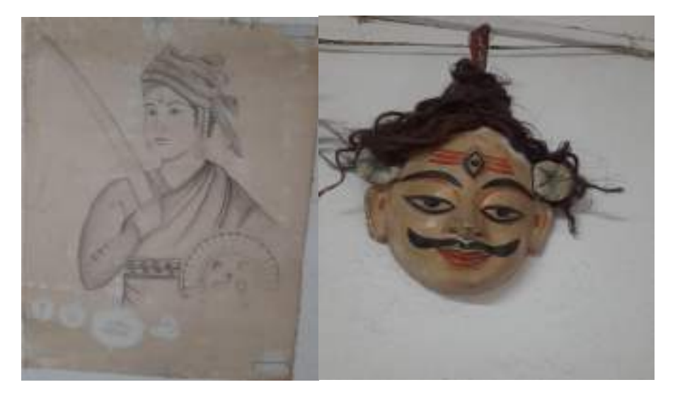
Figure1 Musk making by the student

Students have engaged in various extra-curricular and co-curricular activities.