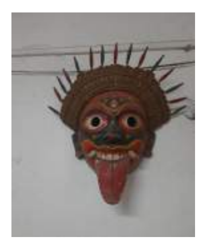
Figure 3 musk making by the student