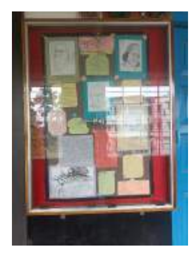
Figure 4 wall magazine by the student