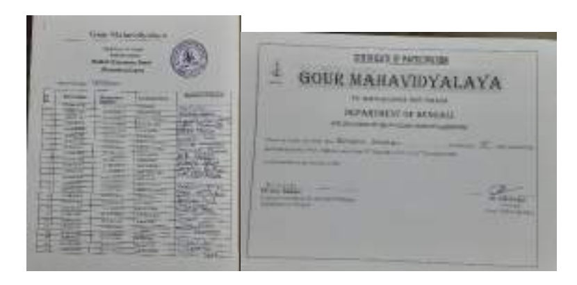
Figure 3 Add on course Attendance sheet