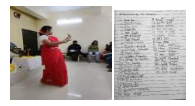
Figure 7 student at departmental dance competition