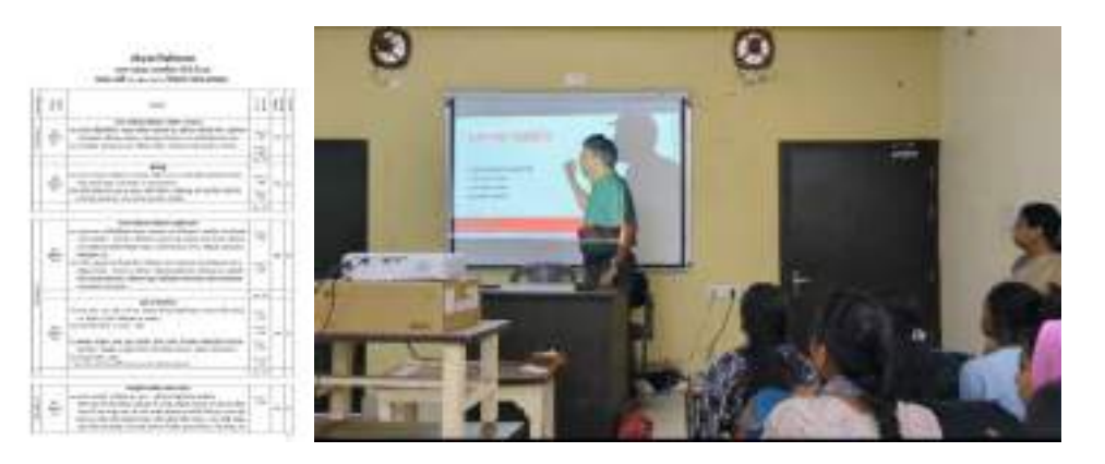
Figure 1 Syllabus on orientation Figure 2 কীভাবে বাংলা সাহিত্যের ইতিহাস পড়তে হয় ( Orientation Program)

A-1. Experiential learning within the framework of Course Curriculum