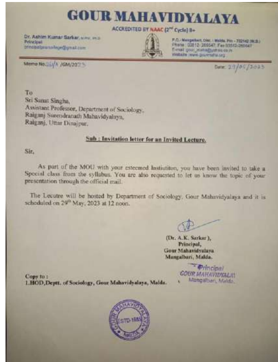
Invitation letters from both the colleges for Faculty Exchange.