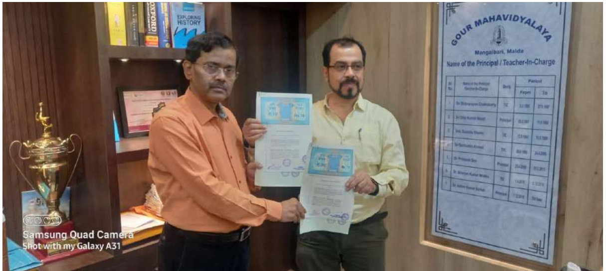
MOU signing between Gour Mahavidyalaya & Raiganj Surendranath Mahavidyalaya.