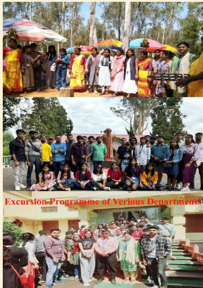
Excursion-Programme of Verious Departments

All departments of Gour Mahavidyalaya arranges educational tour to different interesting places for the students. Through this excursion the students gain knowledge and upgrade their skills to visits the place practically. The excursion programme plays an important role in educating the students in a practical and interesting manner.