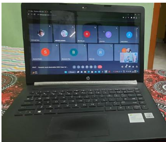
Figure 5Dr. Kshitish Ch. Mahata use laptop in a on line class