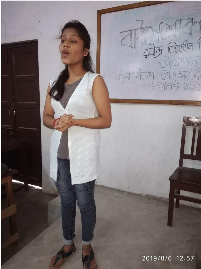
Figure 2 A student in a recitation class