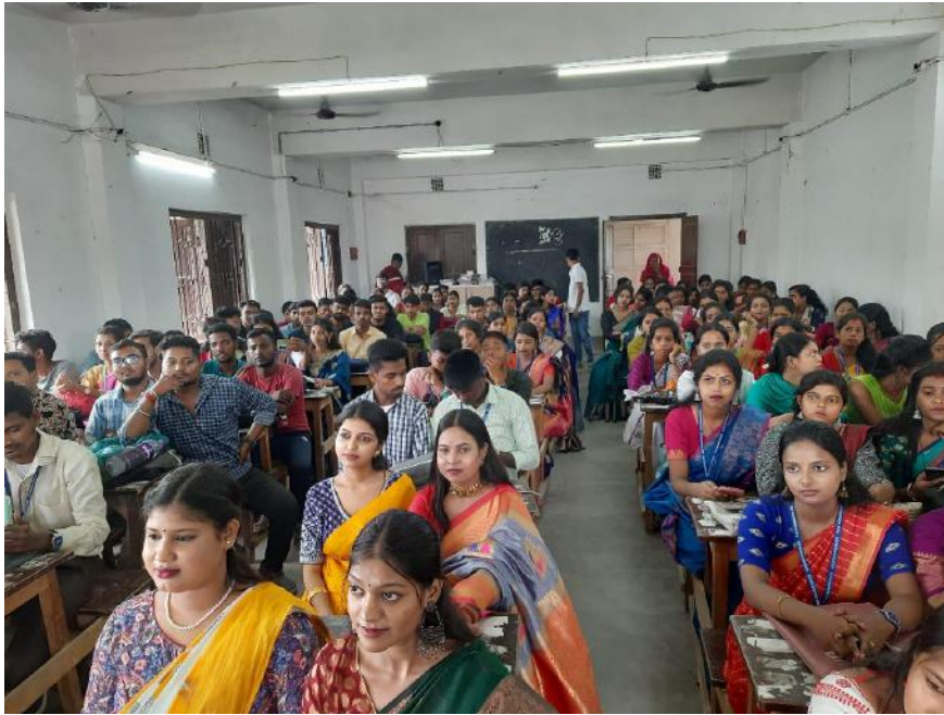
Student on special Lecture on Indian ethics

Syllebus of Bengali has some story and poetry on indian ethics. We organised special lecture on that subject