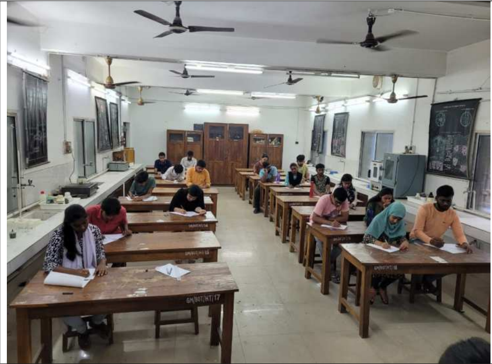
ADVANCED AND SLOW LEARNERS EXAM